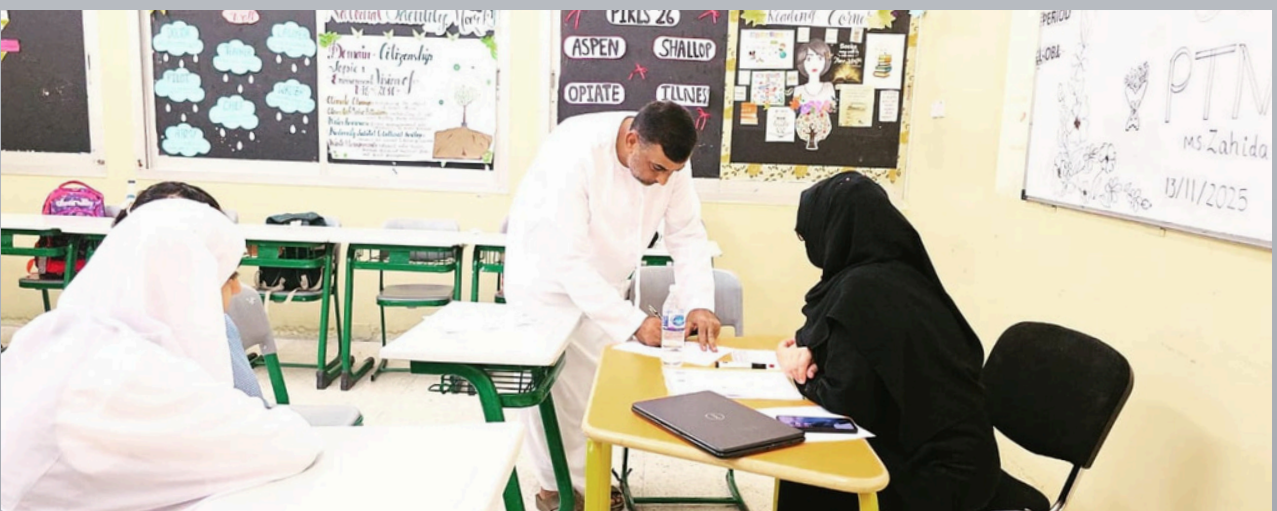
Parent Teacher Meeting