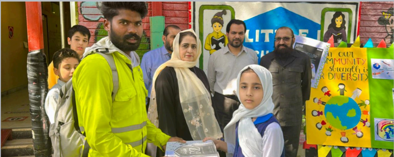
Parents Awareness & Volunteer